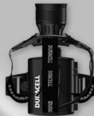
DAYLIGHT 3AA HEAD LAMP