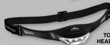
TOUGH HEAD LAMP